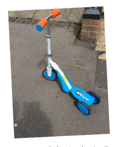
Dales Academies Trust Blair Avenue, Ingleby Barwick Stockton-on-Tees, TS17 5BL